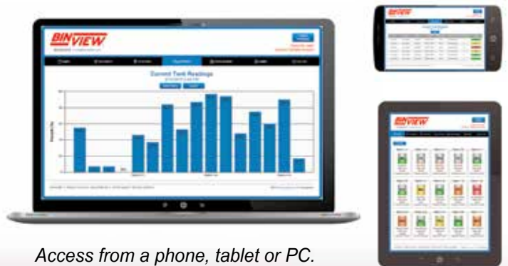
Access from a phone, tablet or PC.

and is accessible from any device with a connection to the internet. Real-time inventory management and automated alerts can be accessed from a Smartphone, tablet or PC. BinView offers both security and control over your assets and users of the application. Super users can have the ability to set up and manage locations, gateways, and vessels, while other users may have view-only or receive alerts-only privileges. The system can be set up so that some users have access to all sites, while others may only be able to access data for a single location.