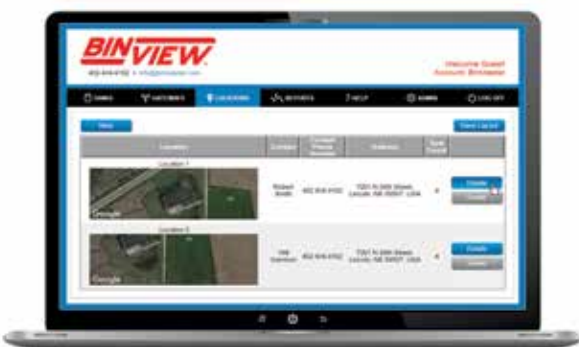
Location view on a PC