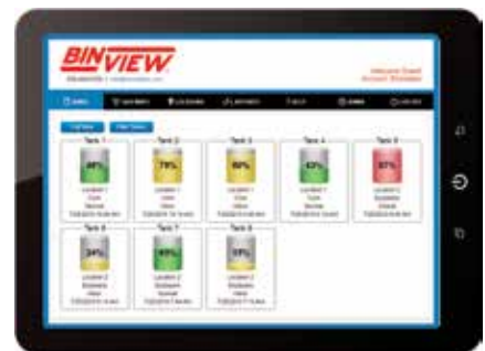
Tank view on a tablet